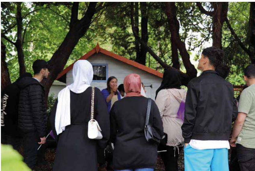
Fig 7.

From November 2021 to October 2022, this project strand encouraged people to come together to transform the Antonine Wall, the former frontier of an Empire, into a community resource, and place of shared belonging.