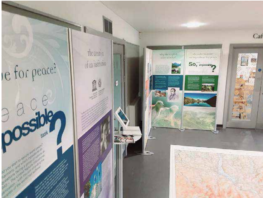
Fig 4A and 4B. Images of Lake district exhibition