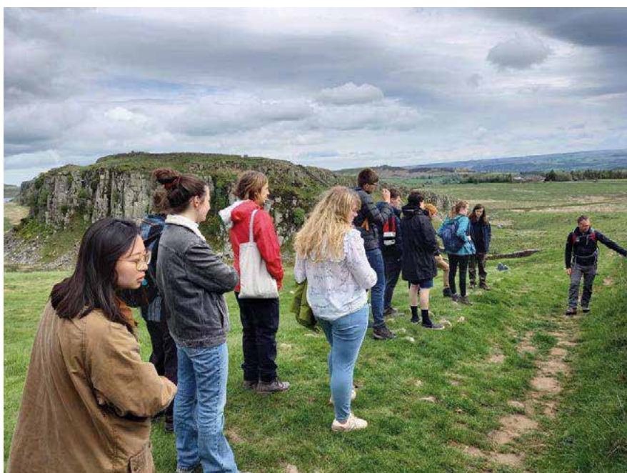
Fig 6a. Hadrian's Wall

The training also provided the YAMS with very useful knowledge to underpin their volunteering roles with Hadrian's Wall partners. A number of YAMS were studying heritage topics at university and were able to apply their learning in higher education settings. YAMS are all about empowerment and giving a voice to young people in the management of World Heritage Sites.