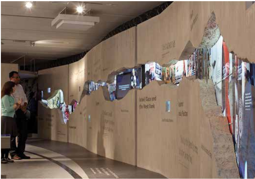
Fig 2. The Living Wall at Tullie House Museum, interpreting Hadrian's Wall