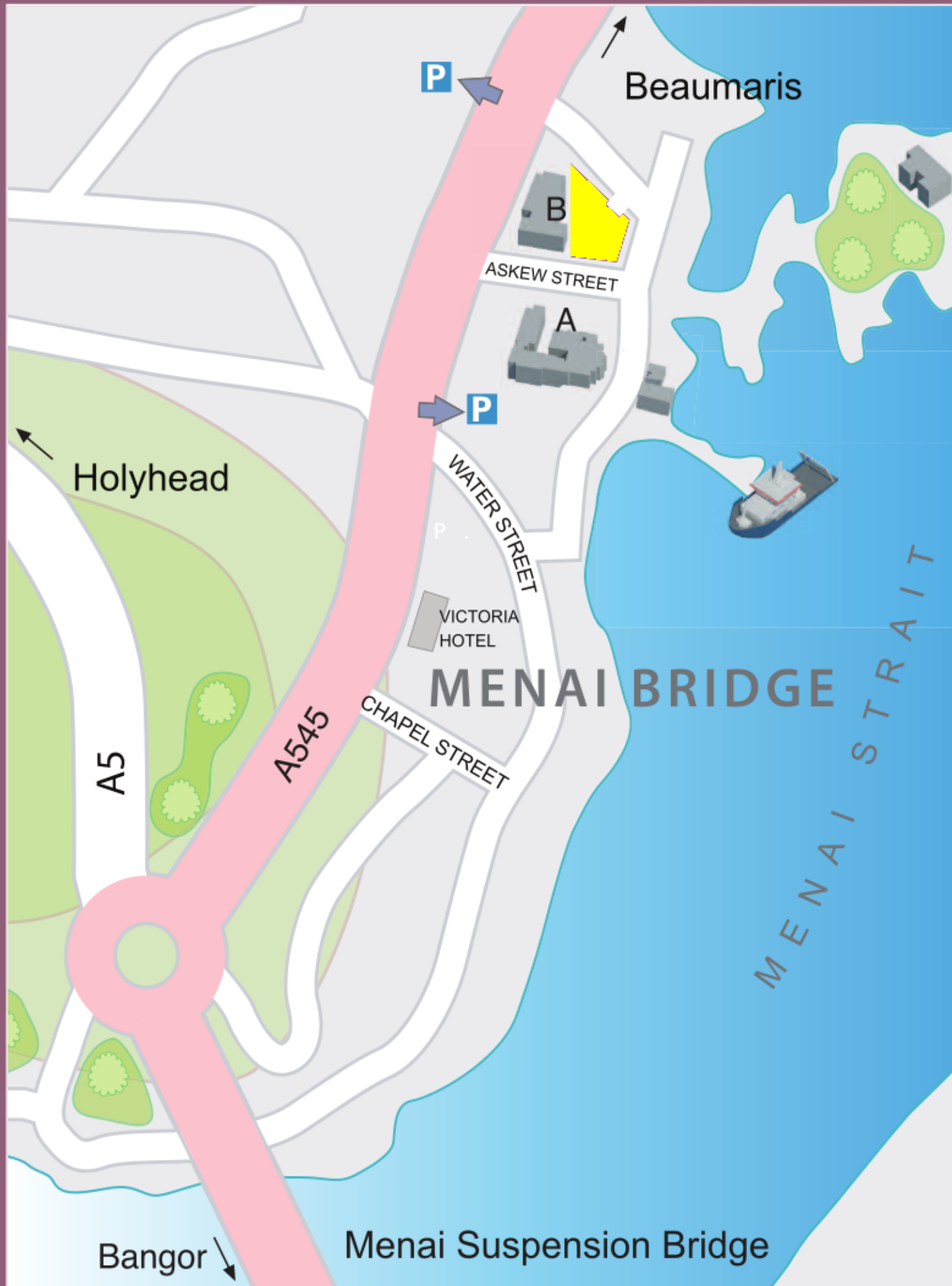
SCHOOL OF OCEAN SCIENCES MAP