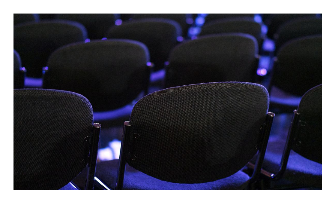
World Heritage UK AGM - Save the Date

The Annual General Meeting of World Heritage UK Charitable Incorporated Organisation will be held on Wednesday 6<sup>th</sup> December 2023 , 10am to 12pm, online (Zoom).