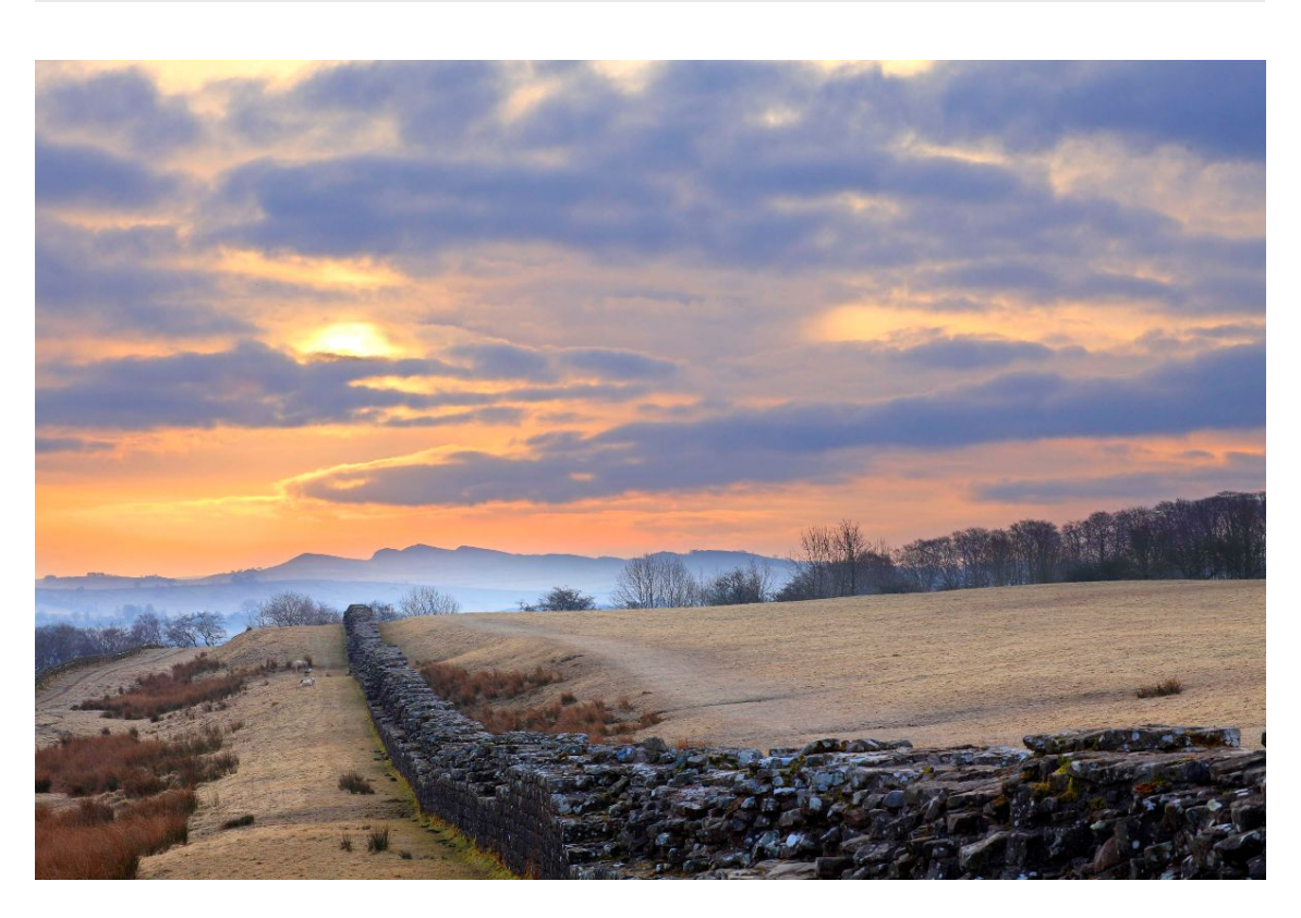
Hadrian's Wall Virtual Networking Days - Save the dates!

Options for attending in person and virtually are both available.