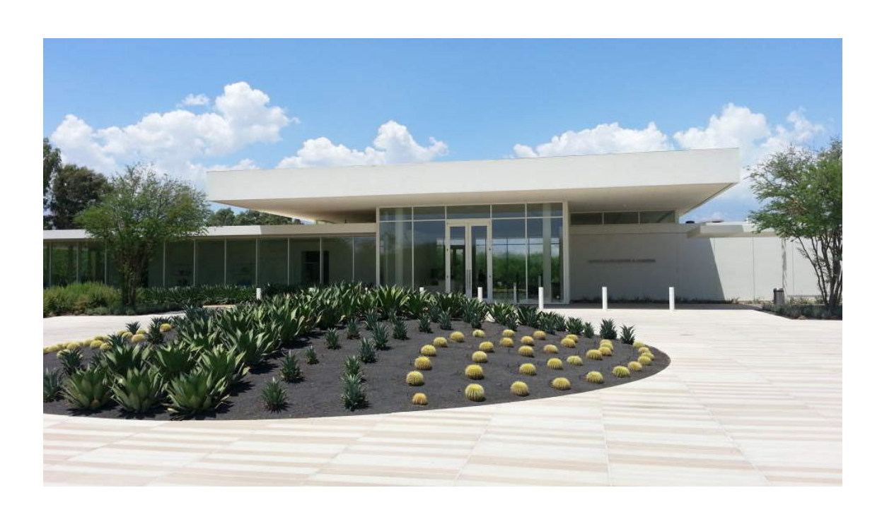
'Visitor Centres in a Changing World' - webinar date announced

World Heritage UK's first webinar of 2021 will take place on the morning of the 18th February and the initial registration webpage can be found <u>HERE</u>