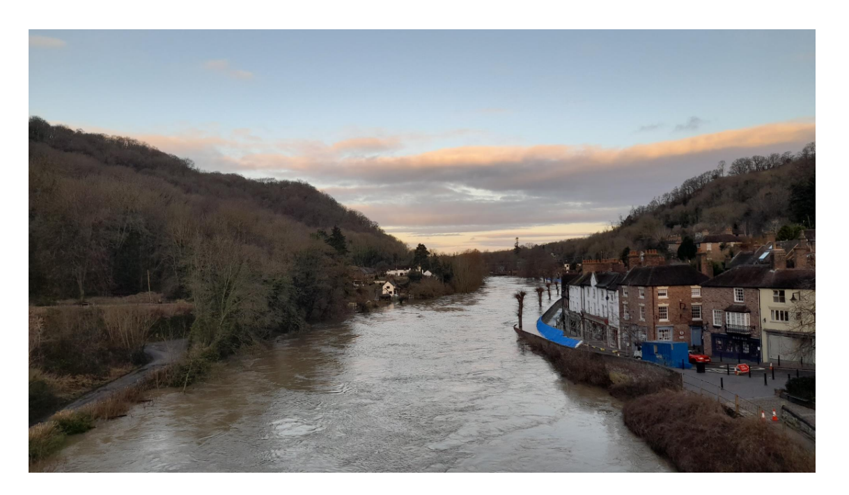
Ironbridge - facing the challenges of flooding

https://www.eventbrite.com/e/world-heritage-day-2022-online-talks-programme-tickets-295203751367